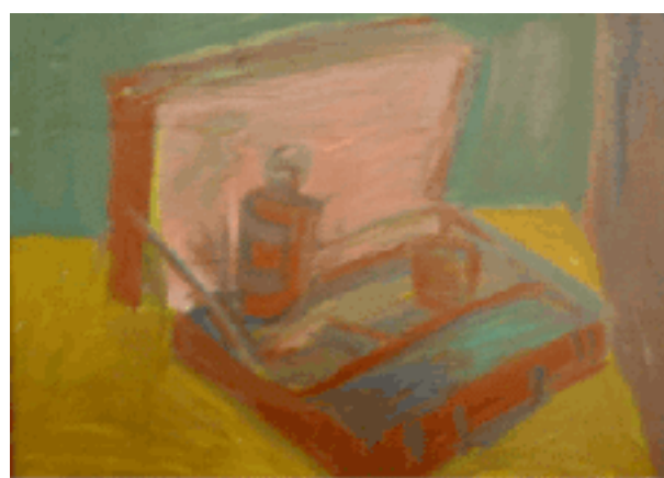
Painting by Nathan Kunika