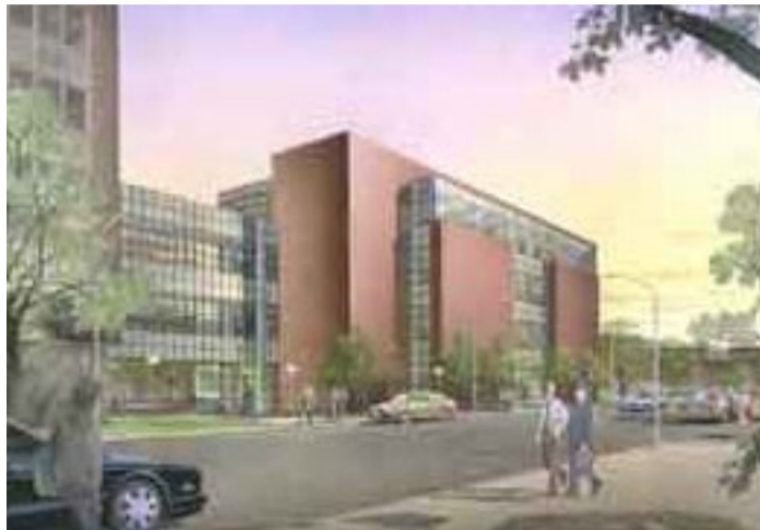
Artist's rendering of the new Pearlstein Business Learning Center for the Bennett S. LeBow College of Business and Administration

The construction of a new facility for Drexel's Bennett S. LeBow College of Business and Administration is just the latest in a long series of successes for one of the University's oldest and most important colleges. Classes in business subjects have been offered at Drexel from its inception in 1891.