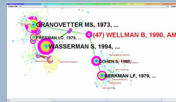
Figure 3. This shows a connecting document (Wellman, 1990) that creates a connection between two large structures in the field. Evaluators were able to identify this document without prior knowledge of the social networking field.