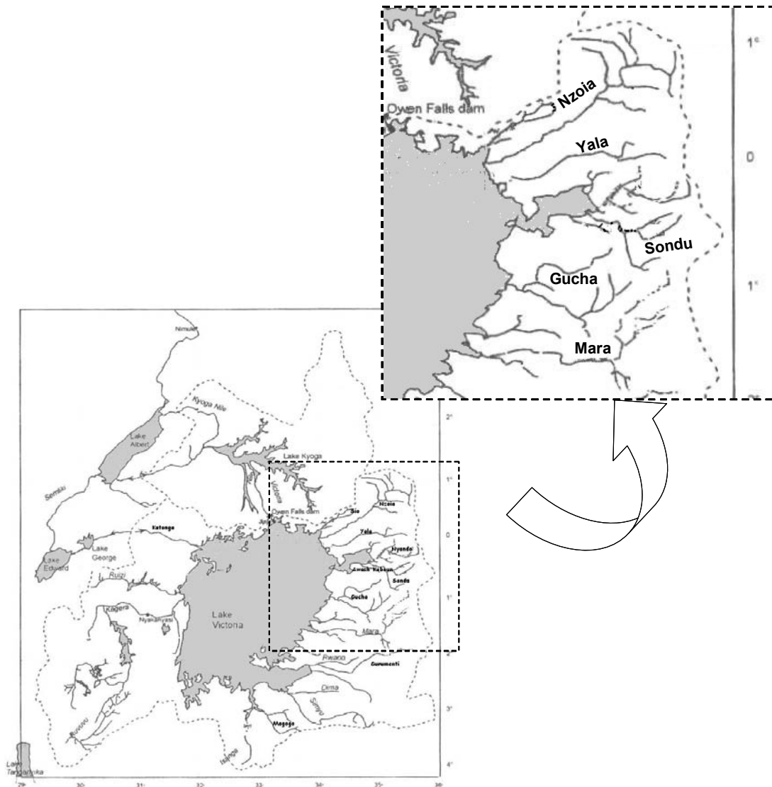
Figure 1 Location of Nzoia, Yala, Sondu, Gucha and Mara river (Sutcliffe and Parks, 1999).